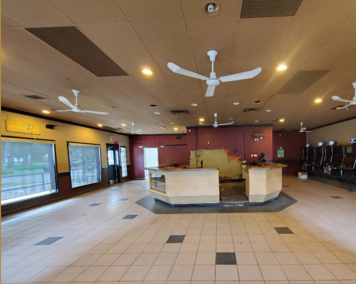
2,000 sq. foot corner bistro, cafe, ice cream shop or...