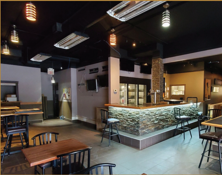
4,000 sq. foot, fully-serviced and fixtured restaurant